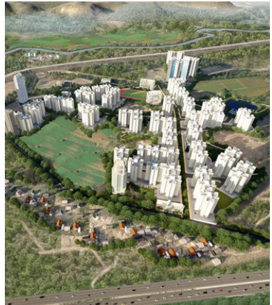
Self-Development - Mass Housing for 10K Police Constables, Mumbai