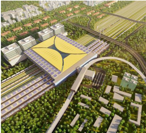
India's first inter-nodal station, Ajni Nagpur